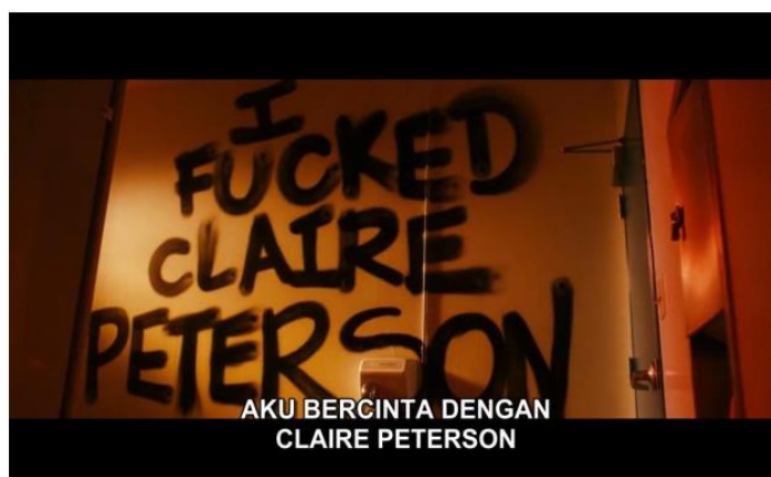
Figure 2. Noah terror

In this movie, terror also can be seen in a scene when Noah damages Claire's husband's (Garret) car brakes. Garret picked Claire's son (Kevin) to school and asked Kevin to drive. Kevin was driving at high speed, making the car lose control and almost crash. While Claire was heading to Vicky's house, she suddenly received a telephone call which was a recording of Vicky's voice asking her to immediately come to Vicky's house because Vicky needed her.